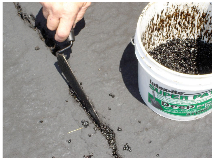
Its's done inch by inch.