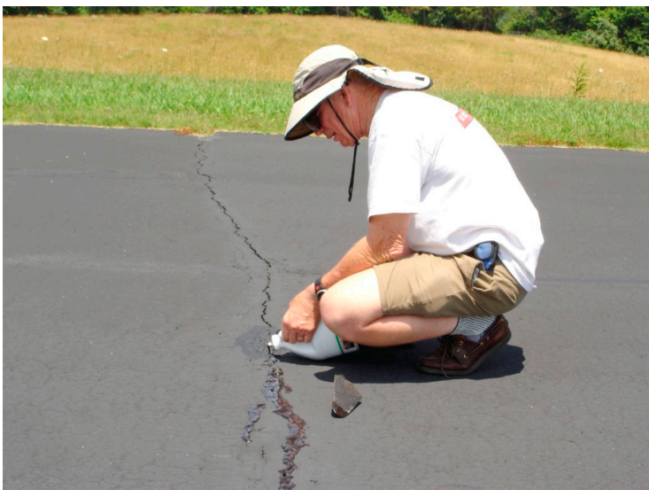
This is painstaking work.